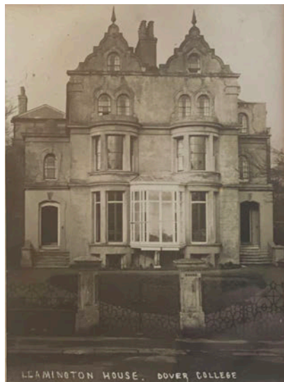
LEAMINGTON HOUSE, DOVER COLLEGE