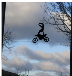
2nd Place Alicia Myers